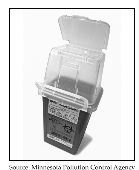
Many pharmacies sell

Put your taped medicine container in another container you cannot see through such as an empty yogurt container.