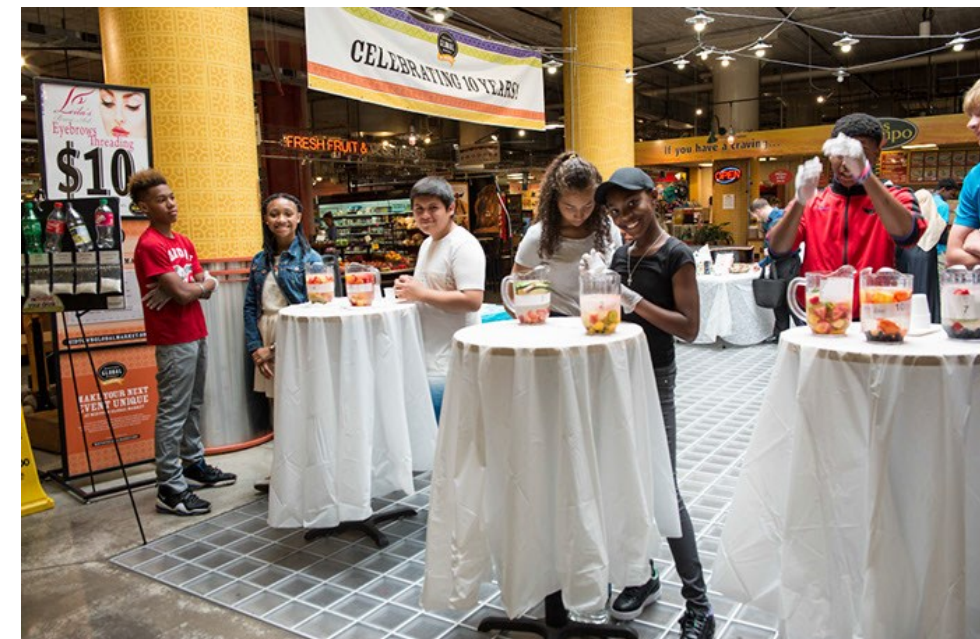
TEENS CHAT promoting infused water beverages during the "Grand Finale" event summer of 2016.

As a result of the success of this pilot project, the City of Minneapolis awarded an 18-month grant to the Cultural Wellness Center to continue the work to create a "Healthy Beverage Zone" in the Midtown Global Market. This work will include youth leadership development as it continues into 2017. More vendors will be recruited to work with the youth leaders to increase sales and consumption of water or water alternative beverages. Eventually, this work will continue with neighborhood convenience stores and corner store markets.