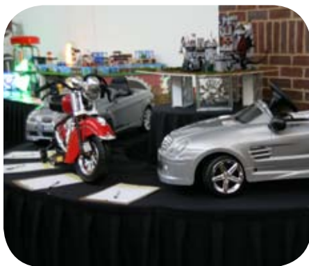
Scenes from the live and silent auction