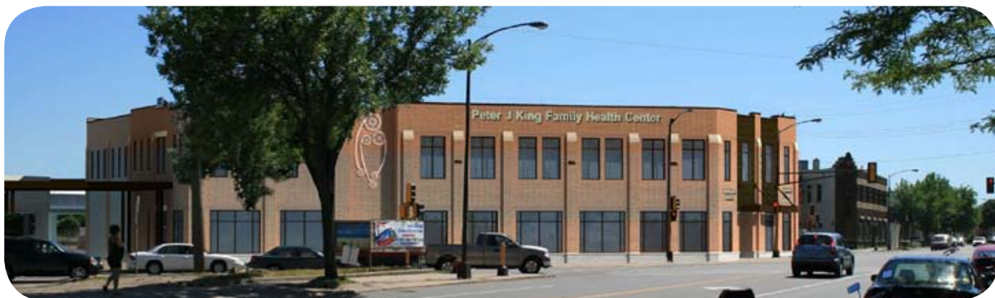
Peter J. King Family Health Center

For information on how you can support the Peter J. King Family Health Center, home of United Family Practice Clinic, please call the United Hospital Foundation at 651-241-8022.