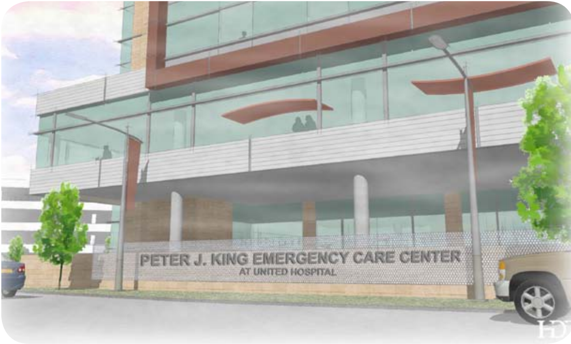
Outside entrance of Peter J. King Emergency Care Center at United Hospital.