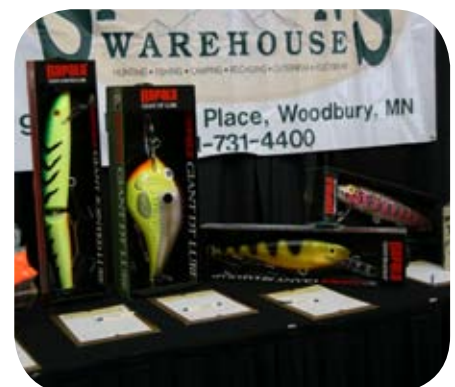
Outdoor auction merchandise