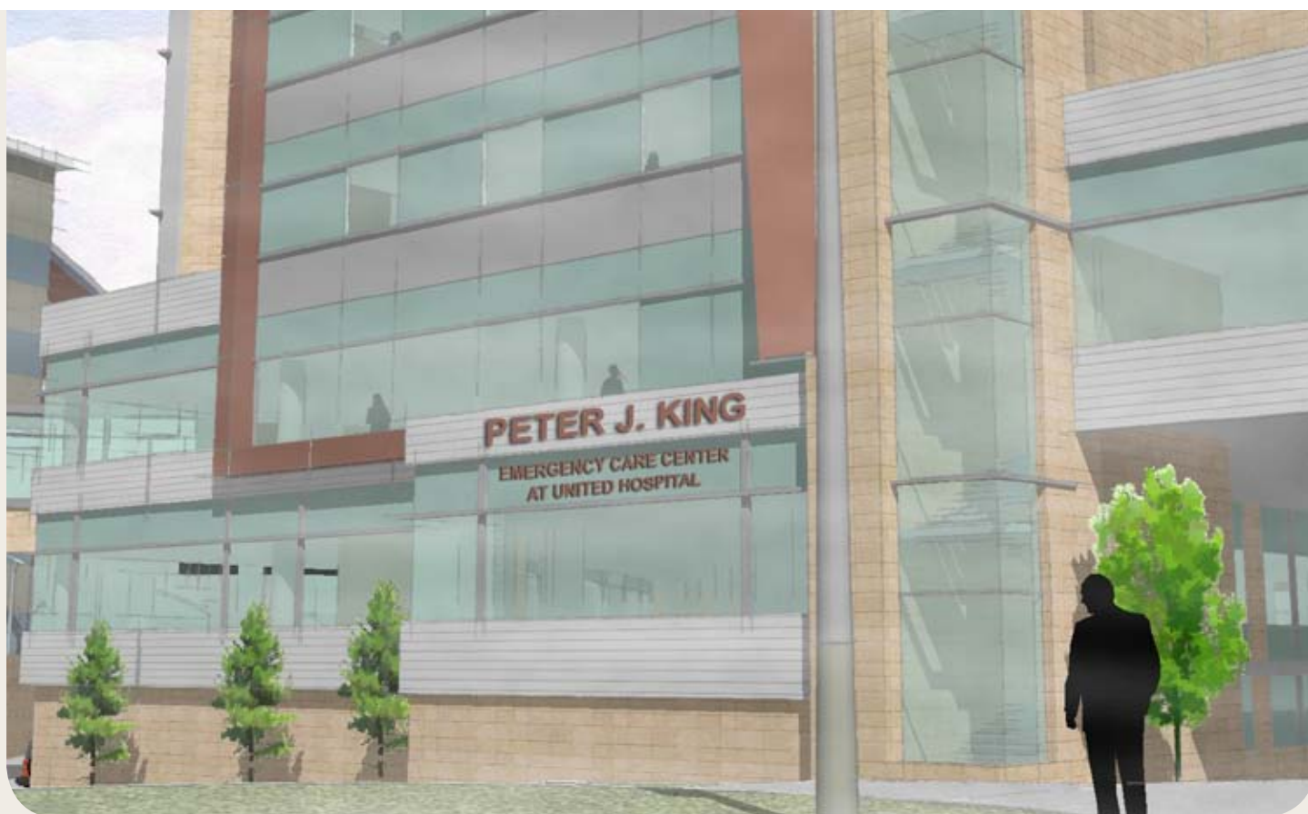
Peter J. King Emergency Care Center at United Hospital. See story on page 3.