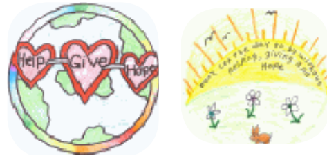
Winning designs of the first-ever Employee & Community Giving Campaign Button Design Contest.

The success of this campaign reflects both the concern and the compassion our employees have as we raised $152,146.15 for United Hospital and United Way.