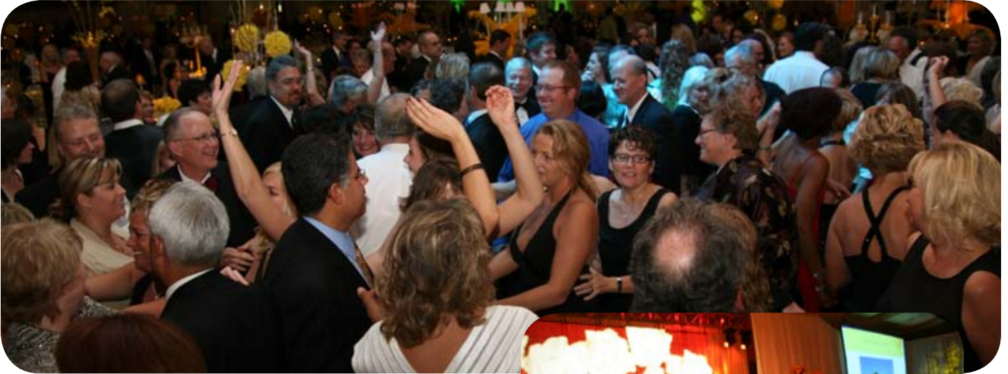
Dancing the night away to The Seville's