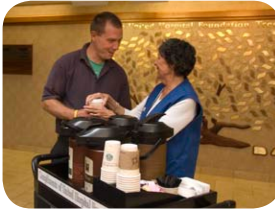
United Hospital's Coffee Cart

“Can I get you a cup of coffee?” You also hear that comforting phrase as you walk the halls of the hospital. Volunteers brew and serve