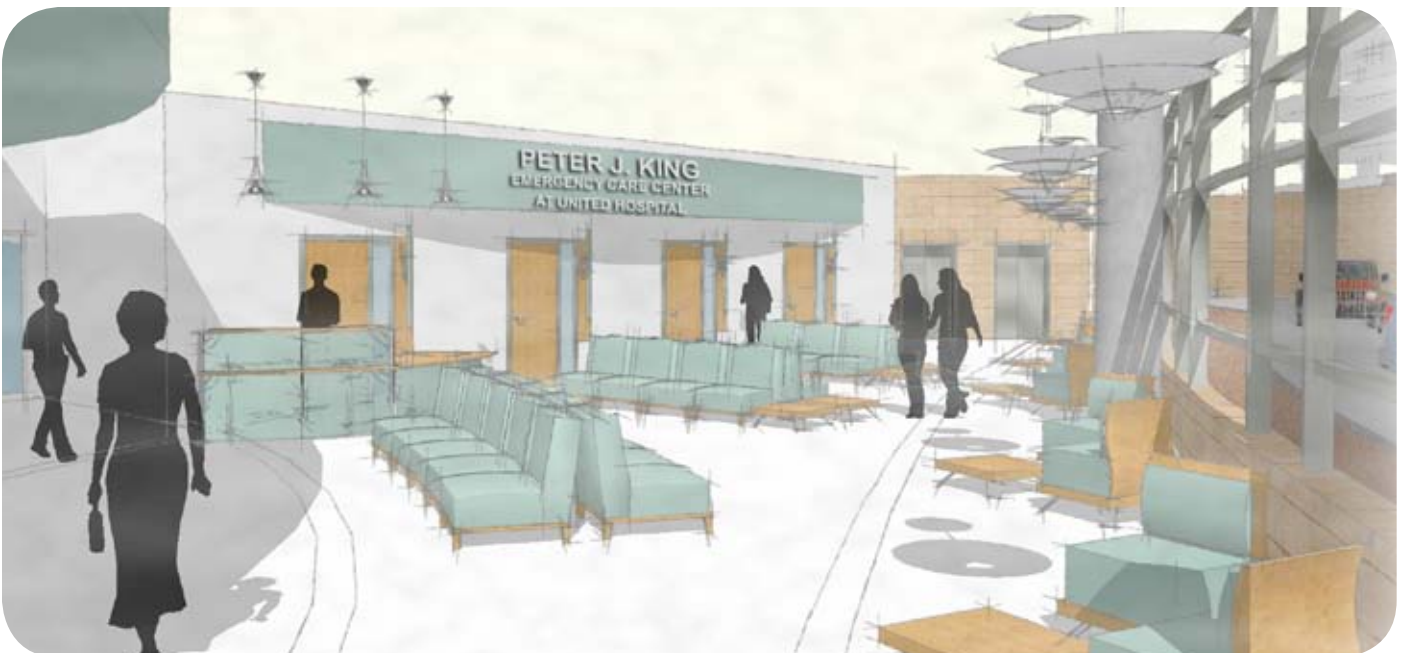
Inside entrance area of Peter J. King Emergency Care Center at United Hospital.