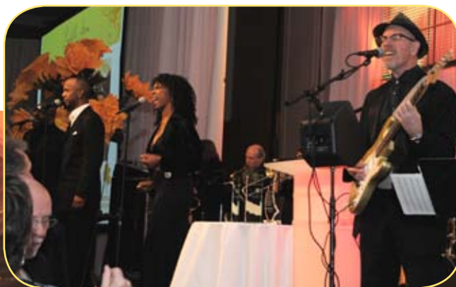
Legendary music group, The Seville's

2008 Service to Humanity Gala