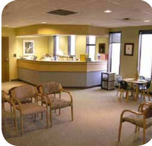
United Pain Center lobby

As with United Hospital, United Pain Center is dedicated to patient-focused care. United Pain Center patients participate in a treatment program that has been specifically developed to meet their individual needs. Also, they can take control of and manage their pain in order to lead a more fulfilling and productive life.