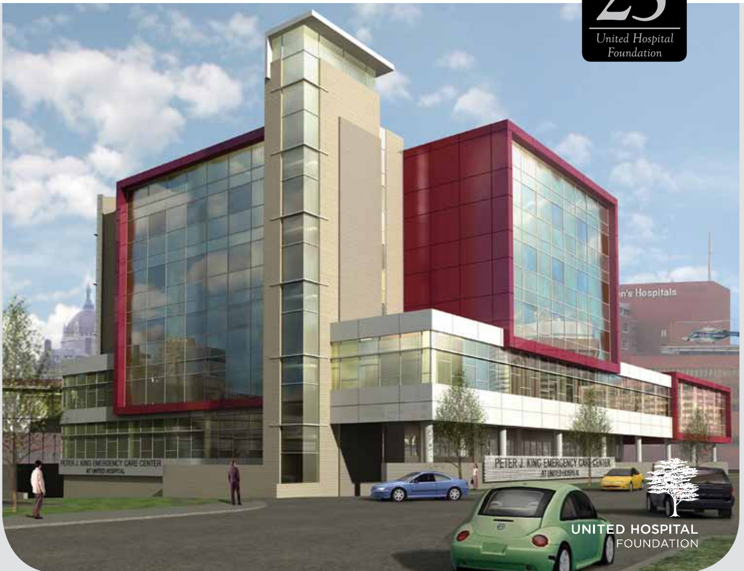
Architectural rendering of the Peter J. King Emergency Care Center at United Hospital.