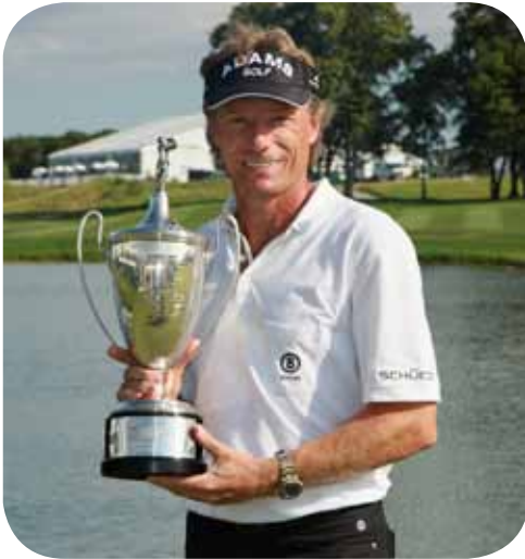
Bernhard Langer, 2009 3M Senior PGA Championship Winner

The 2009 3M Senior PGA Championship was held at the Tournament Players Club (TPC) in Blaine July 6 – 12. Bernhard Langer chipped in for an eagle on the 18th hole to win the 3M Championship – his second straight win on the Champions Tour.