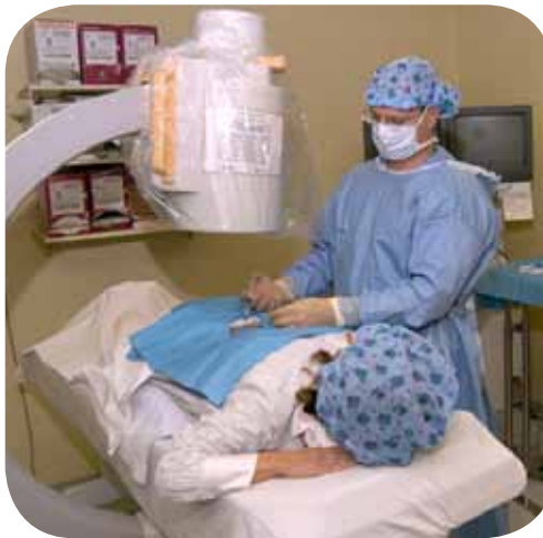
Injections may be part of a patient's treatment plan at United Pain Center.