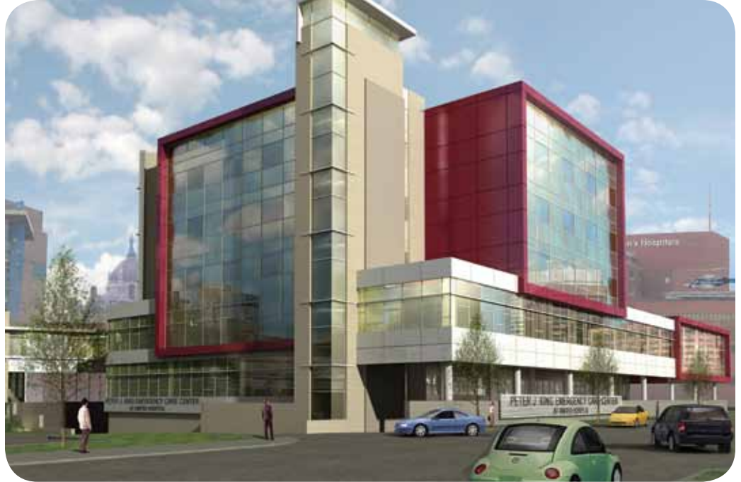
The Peter J. King Emergency Care Center at United Hospital is slated to open April 2011.

On the Web site's main page, click on "Construction Cam" under Helpful Links.