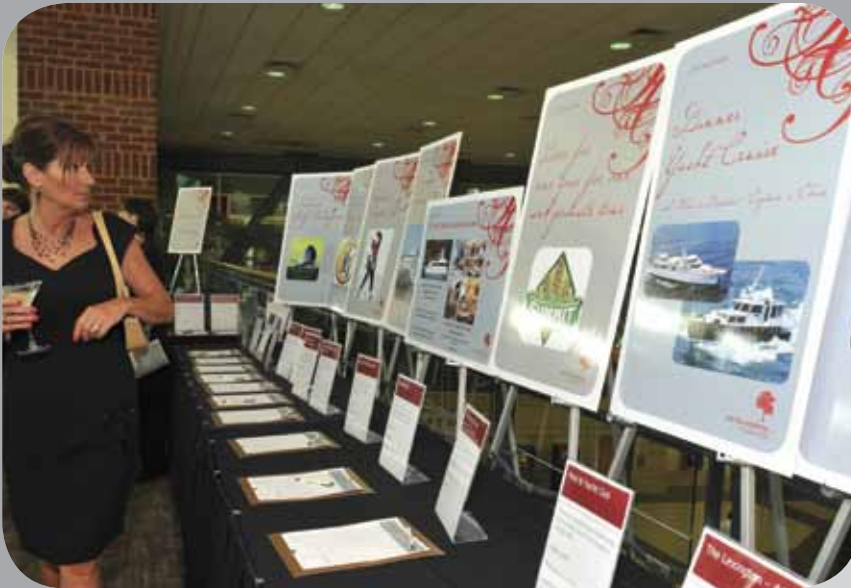
2009 Service to Humanity Awards