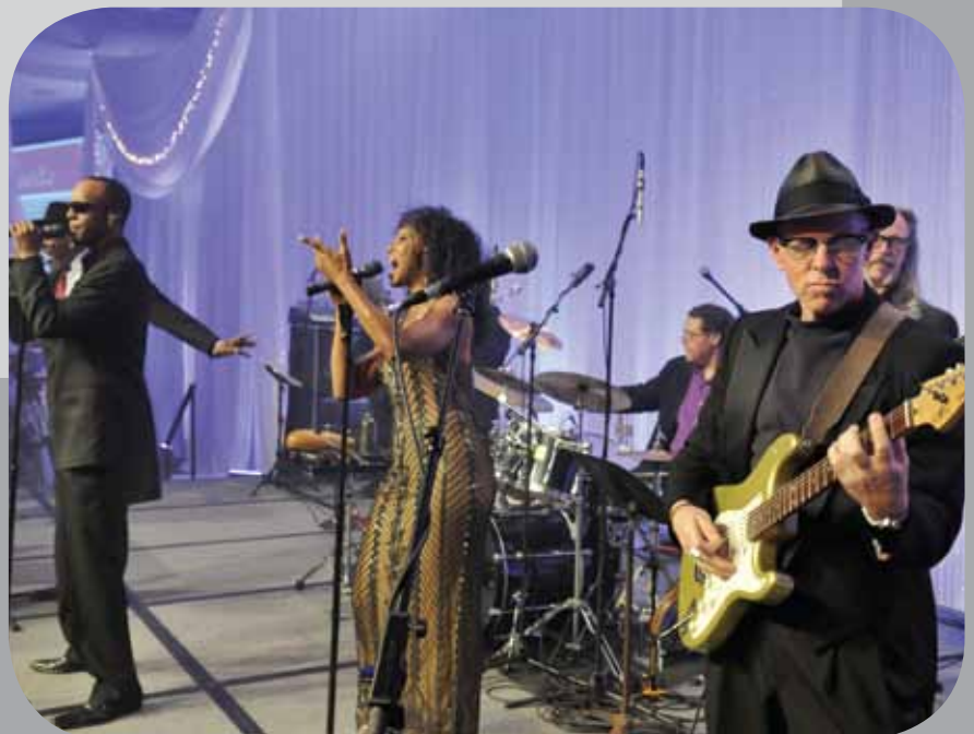
This year's silent auction featured more than 600 items including jewelry, artwork, travel and dining. The evening's festivities were concluded with dancing to music by the legendary group, The Sevilles, in the Grand Ballroom.