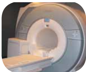
Siemens Verio 3 Tesla MRI

In September, United Hospital installed a new Siemens Verio 3 Tesla MRI, which offers enhanced imaging capabilities over the standard 1.5 Tesla MRI units.