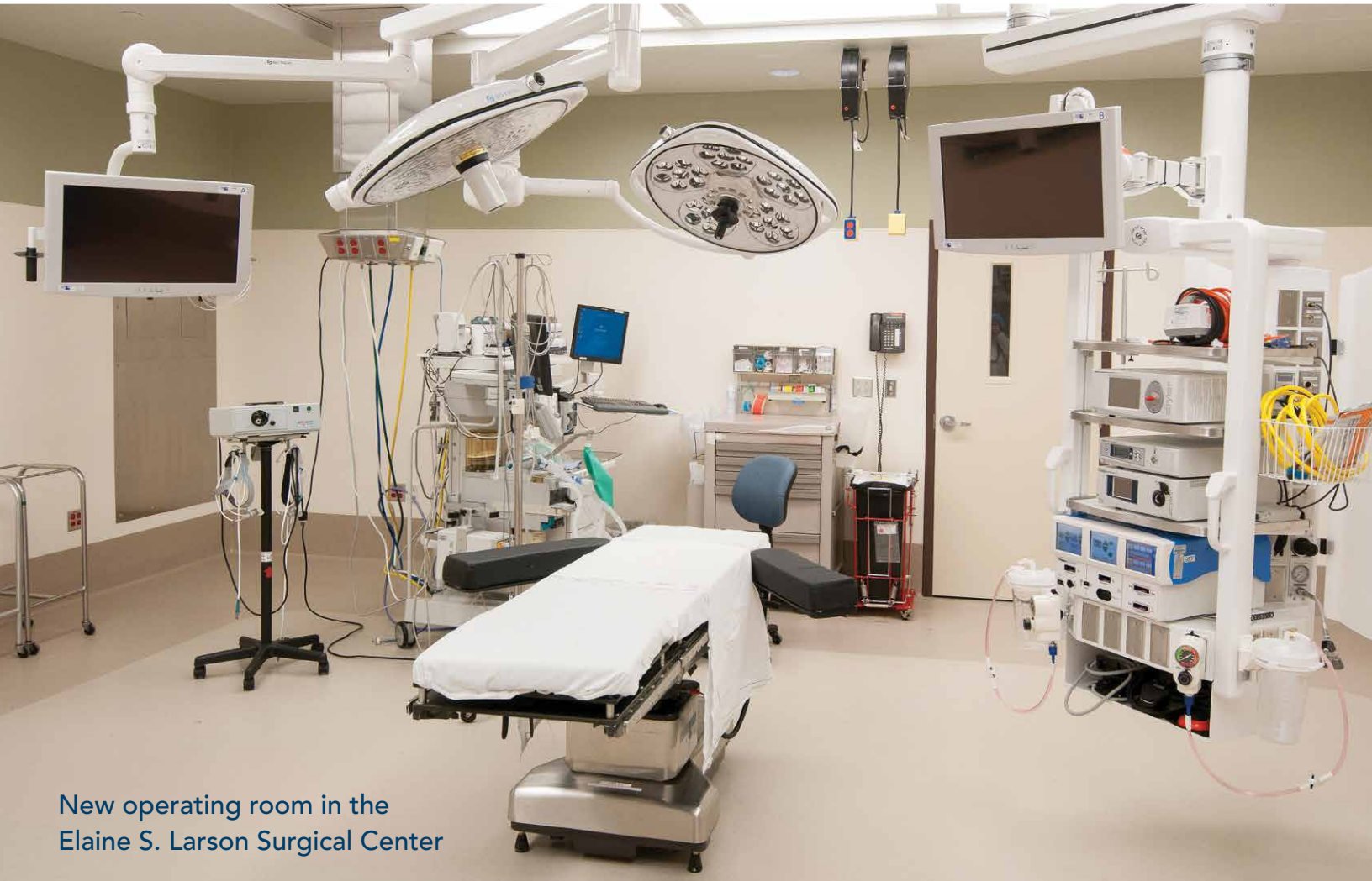
New operating room in the Elaine S. Larson Surgical Center