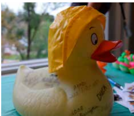
The Courage Kenny employee with the winning duck is awarded this traveling duck trophy!

In 2018, more than $1.5 million was given by Allina Health employees through the Community Giving Campaign to make a difference in our communities. Thank you, employees!