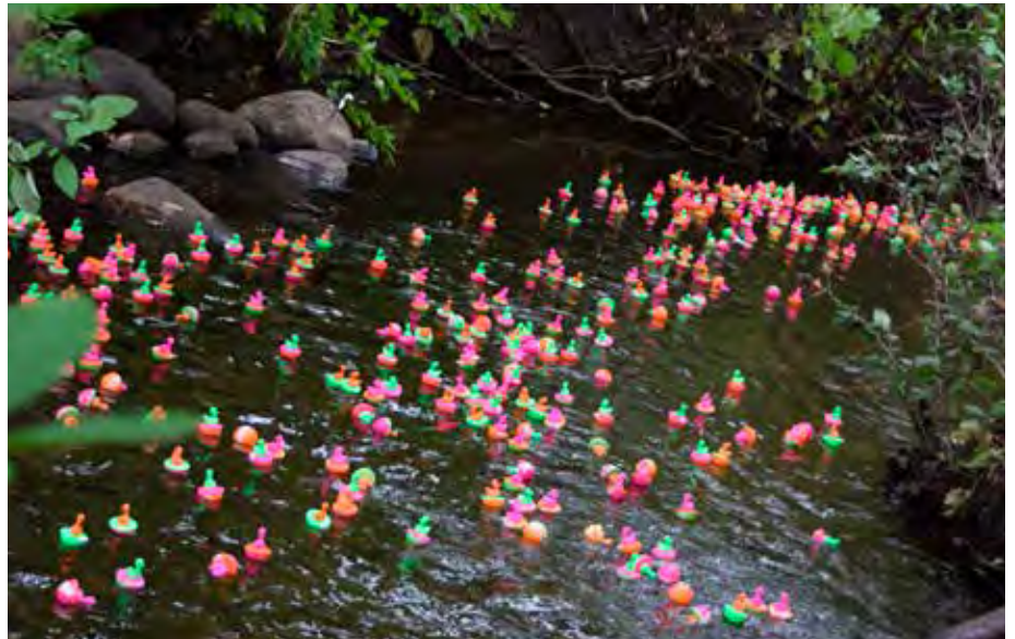
The legacy lives on! The annual United Way Duck Race was tradition for Courage Center employees. The tradition lives on as one of Allina Health's Community Giving Campaign events at Courage Kenny Rehabilitation Institute – Golden Valley. The money raised through duck sales supports Courage Kenny clients and programs. Here, hundreds of rubber ducks race along the creek!