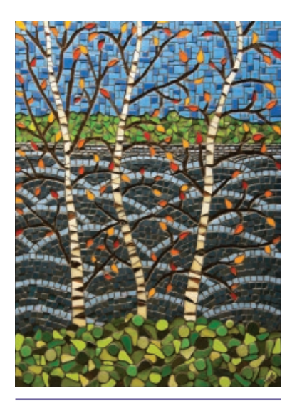
Dancing Birch Suzanne Demeules, Buffalo, MN