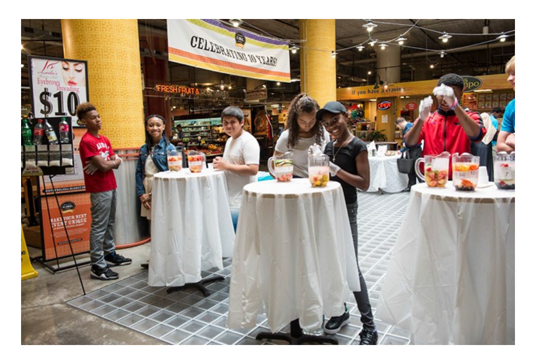
TEENS CHAT promoting infused water beverages during the "Grand Finale" event summer of 2016.

As a result of the success of this pilot project, the City of Minneapolis awarded an 18-month grant to the Cultural Wellness Center to continue the work to create a "Healthy Beverage Zone" in the Midtown Global Market. This work will include youth leadership development as it continues into 2017. More vendors will be recruited to work with the youth leaders to increase sales and consumption of water or water alternative beverages. Eventually, this work will continue with neighborhood convenience stores and corner store markets.