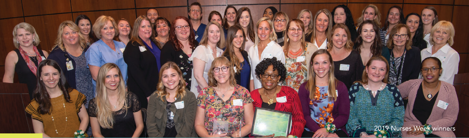
2019 Nurses Week winners