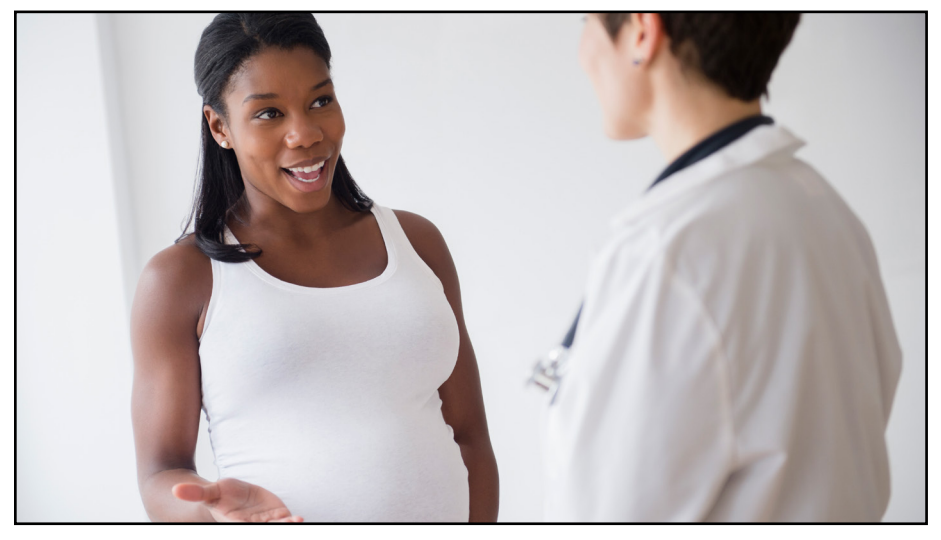
You have access to both screening and diagnostic tests. To learn more, see pages 3 to 5.

Diagnostic testing is available to you no matter which risk category you are in.