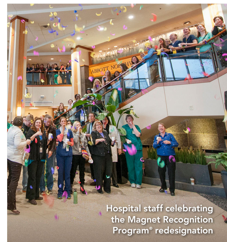
Hospital staff celebrating the Magnet Recognition Program® redesignation