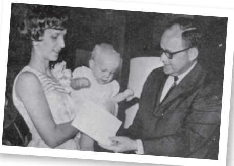
The first baby was born at Unity May 24, 1966 ; she was named Eunice.

The Unity Hospital Auxiliary was formed in March 1966 to support hospital fundraising activities.