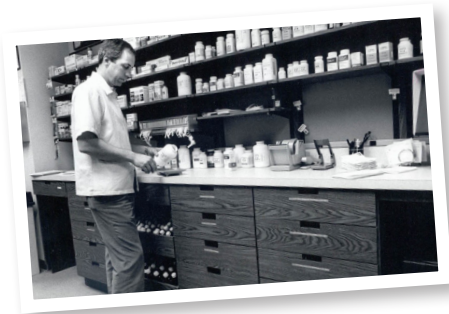
A 24-hour community pharmacy opened in 1986 , one of the first available to north metro residents.