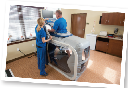
In 2015 , Interlude Restorative Suites, a transitional care facility in partnership with Benedictine Health Systems and Presbyterian Homes and Services, opened on Unity campus.