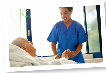
In 2012 , The Virginia Piper Cancer Institute opened on Unity Campus. The ACE (acute care for the elderly) unit also opened. An innovative model of care for older, hospitalized patients, it was the first of its kind in Allina Health and only the second designated ACE unit in Minnesota.