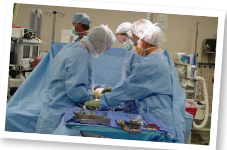
More than 7,000 North Metro patients have benefited from the renowned bariatric surgery program at Unity, which opened in 1996 .