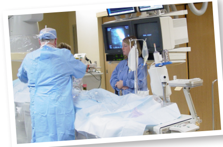
In 2003 , Unity offered new cardiovascular catheterization facilities and upgraded diagnostic equipment; North Suburban Hospital District made a major contribution to the project.