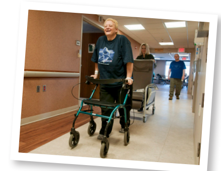
In 2011 , Unity's new Joint Replacement Center opened. Since then, Unity earned The Joint Commission's Gold Seal of Approval® for Hip and Knee Replacement Certification.