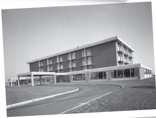
Unity Hospital was dedicated on May 1, 1966 and saw their first patients on May 23.

Between 1971 and 1985 , Unity's licensed beds grew from 150 to 275; a medical office building, a new emergency room and additional surgery suites were added.