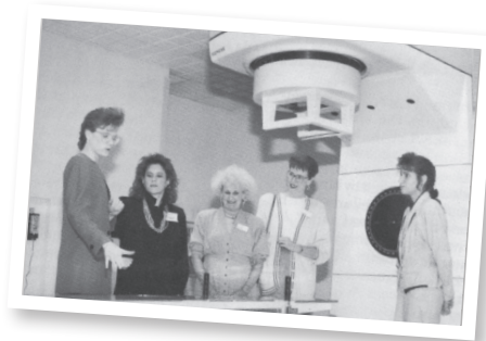
The Radiation Therapy Center opened in April 1992 , providing outpatient cancer treatment close to home.