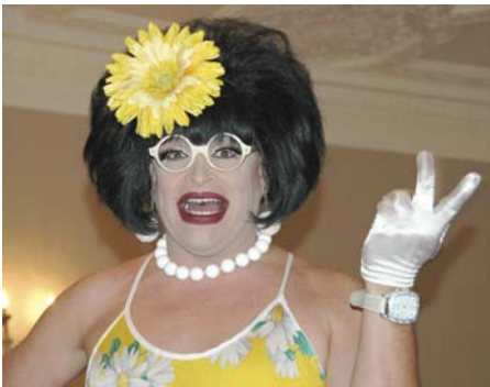
Miss Richfield 1981 Impossible to describe