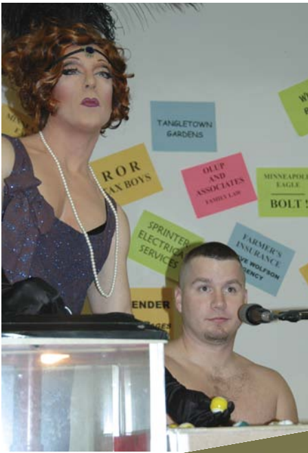
Scenes from Toga Bingo and Bootleg Bingo