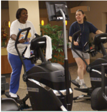
Members working out in Abbott Northwestern's LiveWell Fitness Center.