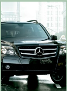
Mercedes-Benz GLK 350 4-MATIC Car Raffle