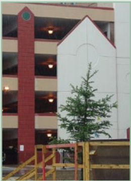
Emergency Care Center Tree Topping Ceremony