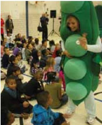
The School Health Connection™ program is helping promote healthy behaviors among students.

To contribute to ExerCare, please contact the United Hospital Foundation at 651-241-8022 or online at unitedhospital.com/unitedfoundation .