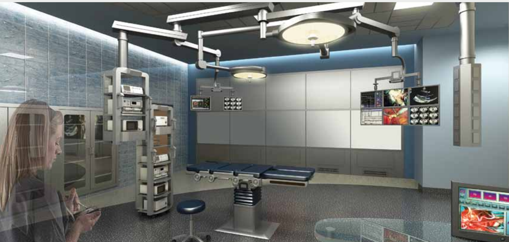
Architectural rendering of surgical rooms