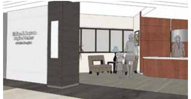
Architectural rendering of reception area for patients and families

Construction will be completed in January 2014.