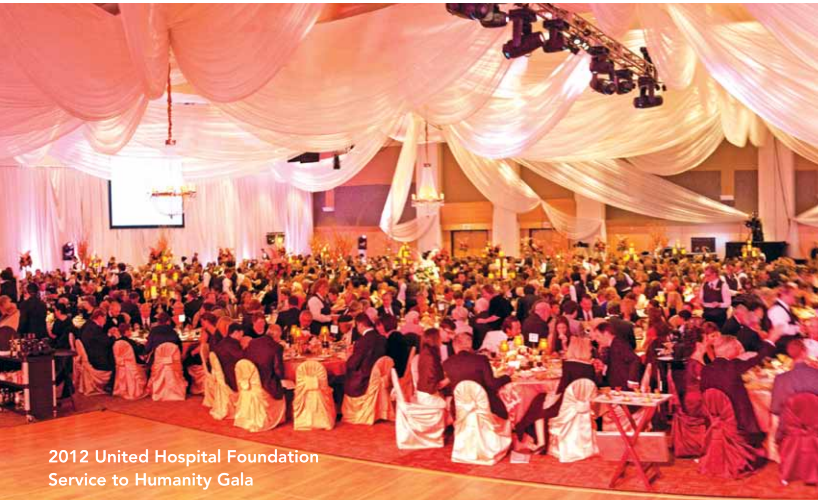
2012 United Hospital Foundation Service to Humanity Gala

MINNESOTA'S LEADER IN PATIENT CARE, SERVICE & TECHNOLOGY