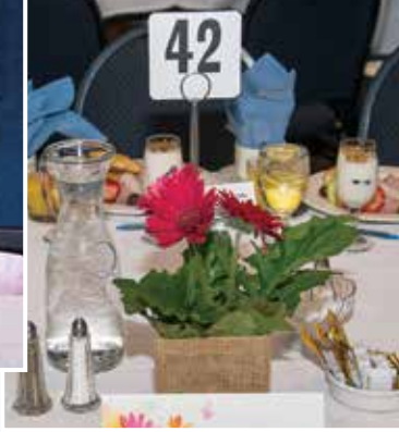
Plant centerpieces for Encourage Breakfast were donated by Costa Farm and Garden.