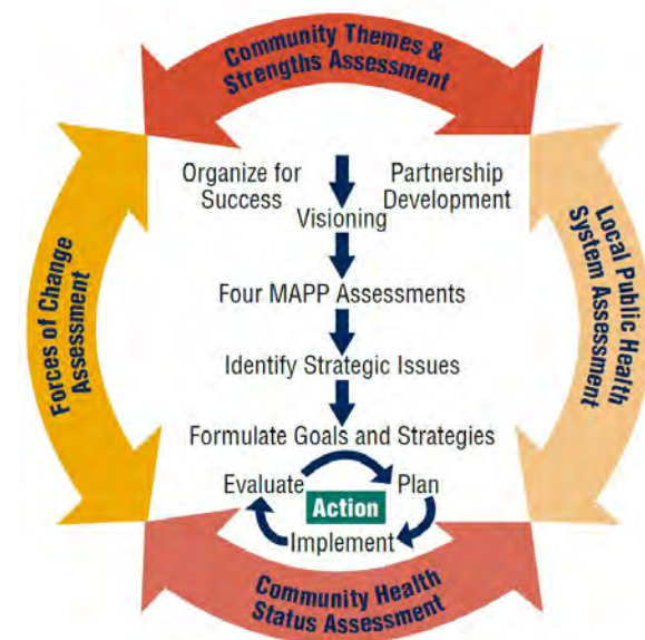
Mapp Process Model

The partnership adopted the MAPP model for assessment and planning. MAPP is a community-driven strategic planning process for improving community health. Facilitated by public health leaders, this framework helps communities apply strategic thinking to prioritize public health issues and identify resources to address them. MAPP is not an agency-focused assessment process; rather, it is an interactive process that can improve the efficiency, effectiveness, and ultimately the performance of local public health systems. Community ownership is a key component of MAPP. Participation from the broader community leads to collective thinking and sustainable solutions to complex problems.