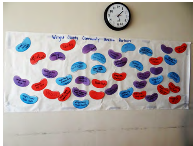
MAPP Community Partners

Some of the evaluation sources include but not limited to the Minnesota student survey, local Wright County survey (comparative data will be analyzed; the collaborative will strive to deploy new survey in 2021), treatment admissions, Electronic Medical Record (EMR) data, number of people reached through educational efforts and community presentations.