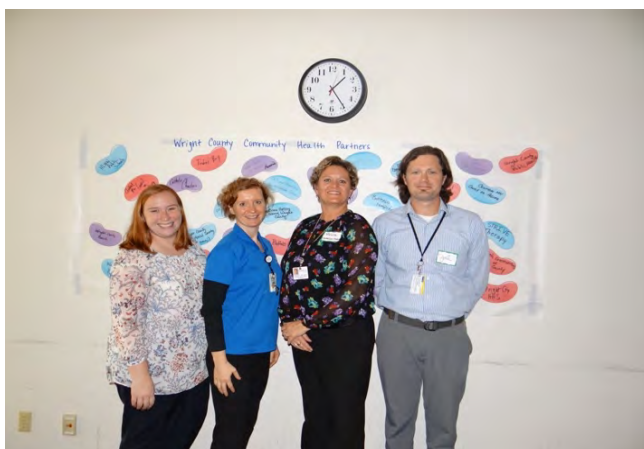
Wright County Community Collaborative members at the visioning event