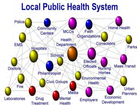
Local Public Health System Structure

In 2016, Wright County Public Health made a decision to align its local public health CHNA cycle with the two large healthcare systems operating in the community – Buffalo Hospital, part of Allina Health, and CentraCare - Monticello. WCCA was included to better understand the specific health needs within low-income populations and enable all participating organizations to work together in conducting data collection, data analysis and prioritization process. WCCA plans to conduct a joint assessment every three years.