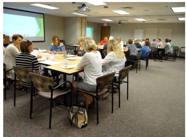
MAPP Prioritization Meeting

Informal conversations over coffee is where our journey started and was ultimately nurtured by a two day training opportunity in May of 2017 on Mobilizing for Action through Planning and Partnership (MAPP). All organizations involved in the Wright County Community Health Collaborative were able to attend. Shortly after this training in one of our meeting we all agreed upon that it made sense to use the MAPP model and committed to each other we were in this journey together.