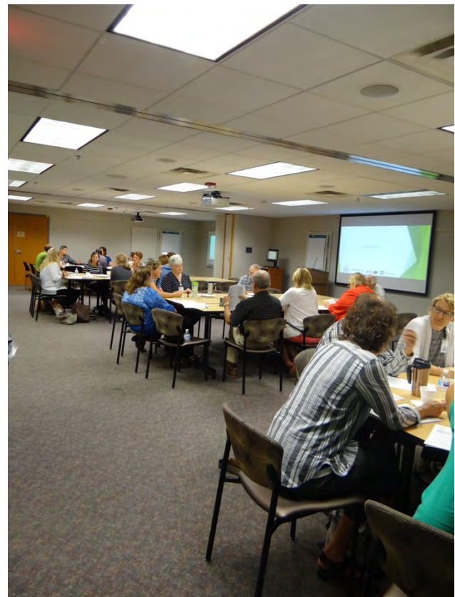
MAPP Prioritization Meeting