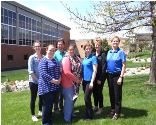
Wright County Community Health Collaborative members